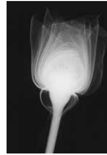
Neutron Radiograph of a Rose

The collection includes an assortment of flowers, seashells and a variety of complex mechanisms.